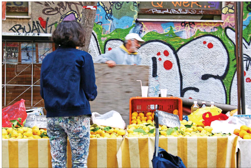
Colour blocking: this edgy Athens neighbourhood packs a visual punch, with popping graffiti and street art, plus a weekly farmers' market