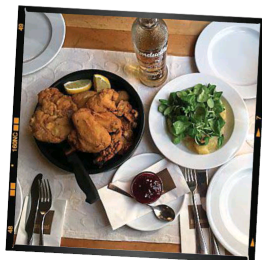
Chicken tonight: Café Hummel